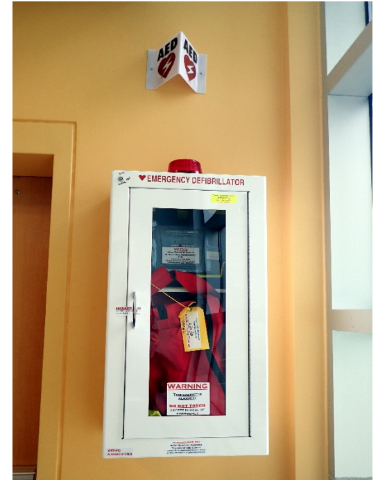
Field House Second floor