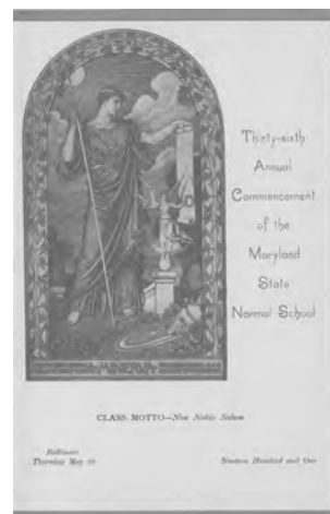
This 1905 Commencement program of the Maryland State Normal School depicts Minerva, Roman goddess of wisdom.