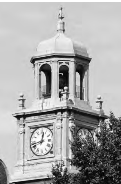
Stephens Hall Bell Tower