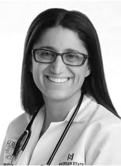
MONA HANNA- ATTISHA, M.D.

PEDIATRICIAN, PROFESSOR, AND PUBLIC HEALTH ADVOCATE WHOSE RESEARCH EXPOSED THE FLINT WATER CRISIS