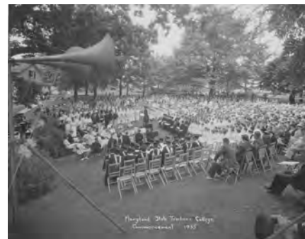
1935 Commencement on Glen Esk lawn: The first graduates to receive baccalaureate degrees are seated and dressed in regalia. Before this, graduates wore white gowns or suits.