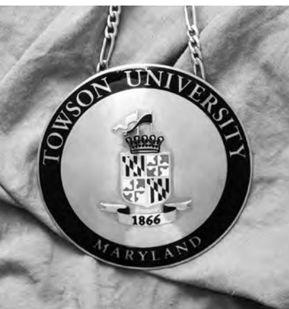
Presidential medallion bearing the university seal