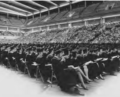
Due to increasing graduating classes, ceremonies were held in Baltimore's Civic Center during the 1970s until the construction of the Towson Center in 1976.