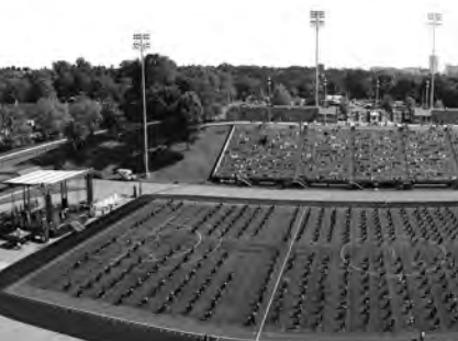
Today Commencement ceremonies are held in the Johnny Unitas® Stadium and split over three days, to accommodate the number of degree candidates and guests.

in 1960, was the second building to bear her name on campus. It housed the campus elementary school until 1991, when the experiment in campus elementary schools ended. In 1949, the curriculum was expanded and students could now opt for a degree in elementary education or primary education. This is also the year that the school was first accredited by the Middle States Association of Colleges and Schools.