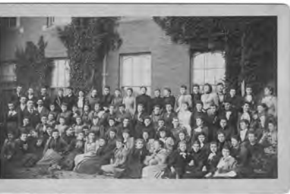
Class photo: MSNS students seated outside the building at Carrollton and Lafayette avenues in Baltimore. The school called this home from 1876–1915.

In 1864, in the midst of the American Civil War, Maryland ratified a new state constitution and created a school for the instruction of teachers, naming it the Maryland State Normal School (MSNS). Normal in this instance referred to écoles normales , a French term for teacher training institutions.