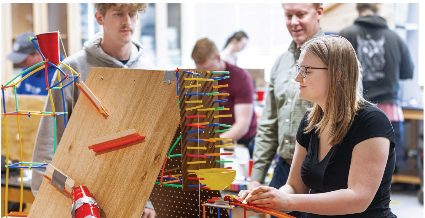
Salisbury University's new engineering physics major gives students the opportunity to fast track their ways into careers in aerospace and nanotechnology.

from the Sellinger School of Business, they can gain a competitive edge in the job market and save time and money while they do it. Plus, earning a master's degree from Sellinger can open doors to higher-level positions, a larger professional network and increased