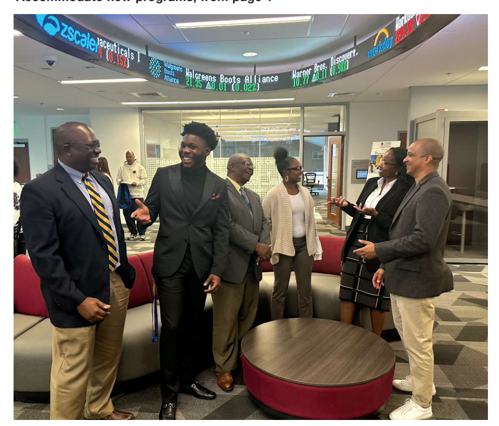
The college of business at Coppin State University took occupancy last fall in a new, multi-story building.

The building provides a variety of areas that serve as learning laboratories for students, with ample opportunities for instruction, networking and support. The classrooms throughout the building are non-traditional, with the opportunity for faculty members to innovatively reconfigure the space to include breakout and focus areas to meet the needs of the class. There is a board room for meetings and presentations, equipped with a separate observation room, and other intentioned spaces like breakout rooms for small groups and spaces for privacy and confidential consultation. Larger, open areas, including an outdoor atrium and courtyard, host receptions and meetings for large groups.