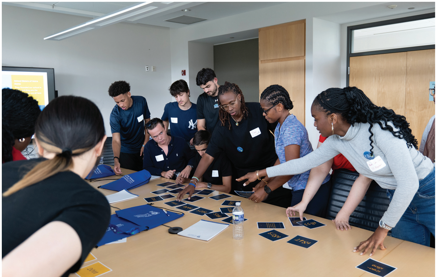
At Notre Dame of Maryland University, current international students support new arrivals as they report to campus to begin their four-year college experience in a new country.