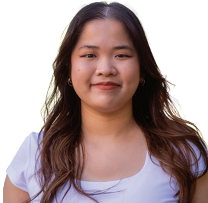
Mekila Ha Housing & Residence Life