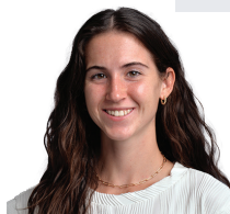
Abbey Frock Campus Recreation