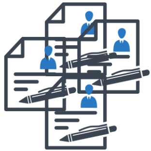
1. Application Pool