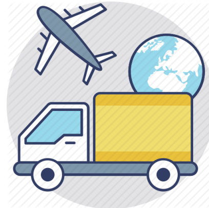
5. Grant submission