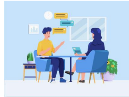
3. Interview with PIs