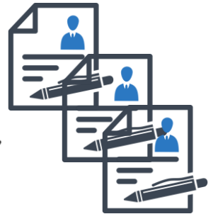
4. Applicant Recommendations