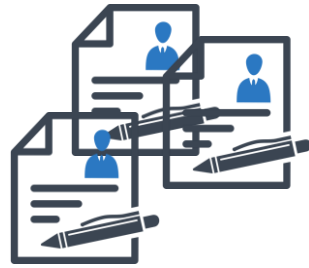
2. Complete Applications